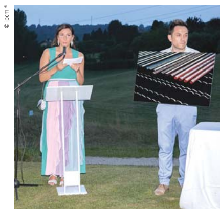
A moment of the auction of last 24 July.

For further information: www.lucreziaroda.com